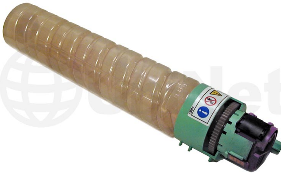
RICOH CL-4000 (TYPE 145) SERIES TONER CARTRIDGE